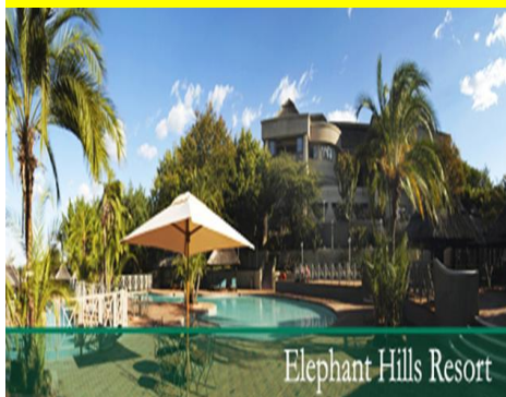
Elephant Hills Resort

SAMSA will be thirty-three years in December 2014 and it has continued to serve as an avenue for the exchange of knowledge, information and provoking new ideas in problem solving among experts from Southern Africa’s academic, industrial and commercial sectors. SAMSA has always extended invitation to experts from countries outside the region, who have been gracious enough to be present to share their ideas at the conferences. Being conscious that the world is increasingly becoming one, SAMSA thought it necessary to involve the global village. The international event intends to bring together over 100 delegates from all over the world. For the first time in its history, the SAMSA conference will be held in Victoria Falls, a town known for its beauty and tourist attraction in the form of one of the seven wonders of the world, the mighty Victoria Falls . The conference will be hosted by the Department of Applied Mathematics at the National University of Science and Technology (NUST). In the past 33 years of its existence, SAMSA has managed to get sponsorship from Norway through the NUFU and NOMA programmes that have enabled at least 100 students graduating with Masters and/or Ph.D/D.Phil degrees in Mathematical Modelling. SAMSA is also in partnership with Auburn University, US, through the MASAMU programme whose main emphasis is research in Mathematical Sciences.