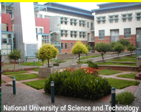
National University of Science and Technology