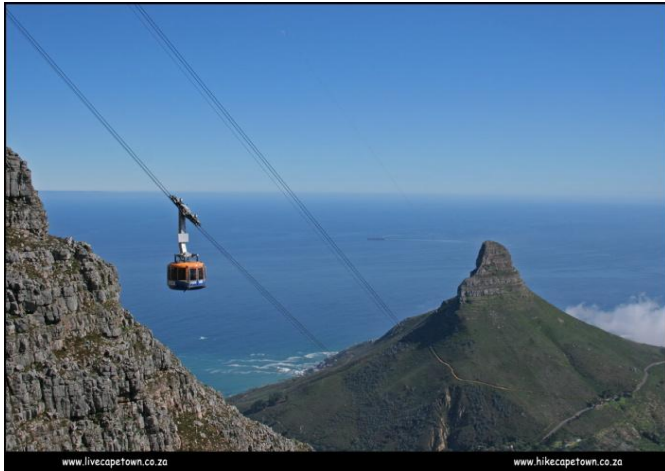
Table Mountain Cableway

The city of Cape Town, which is the venue for the SAMSA2013 Conference, is a vibrant city boasting breathtaking scenery: mountains from every vantage point, beautiful beaches, and a wine region within an hour's drive from the city centre. Its cosmopolitan lifestyle is one that possesses distinctly African features.